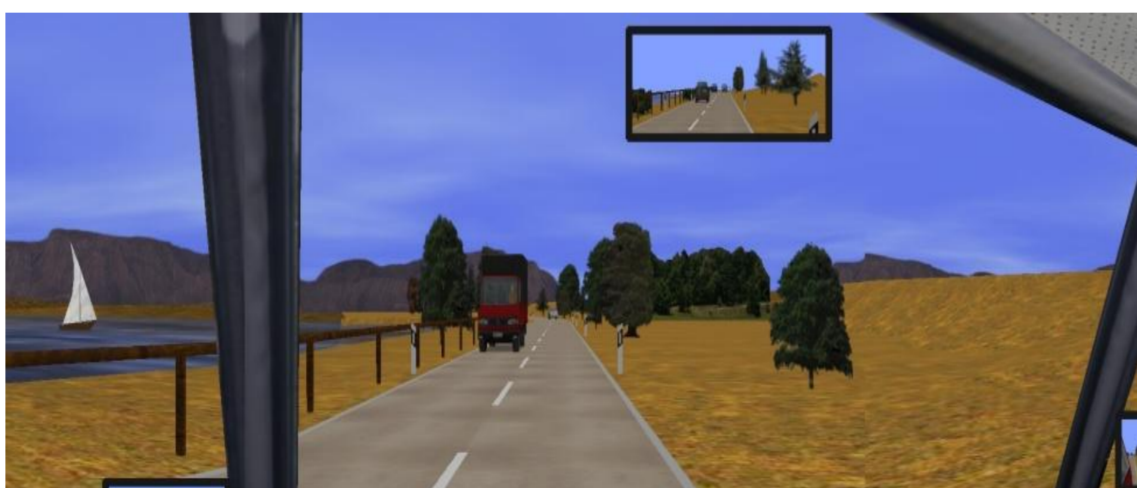
Figure. 1 Driving under the rural Condition

Phase 2: Driving session: driving on a two-lane rural road for 20 min. The sudden appearance of animals on the rural road played the role of unexpected incidents during the driving assessment.